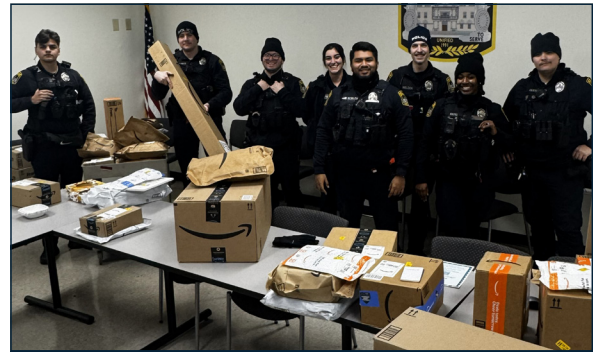
Police's west patrol midnight shift split up the abandoned packages and hand-delivered each one.