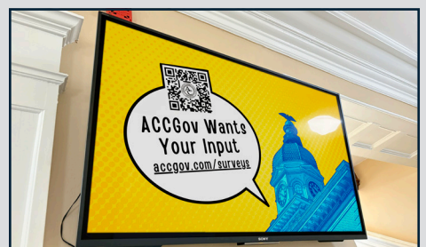
City Hall is one of the eight public places where residents can watch ACTV.

Residents can watch the displays in public spaces at the Tag Office, Animal Services, the Multimodal Transportation Center, City Hall, the Water Business Office, Elections, Satula, and the Airport.