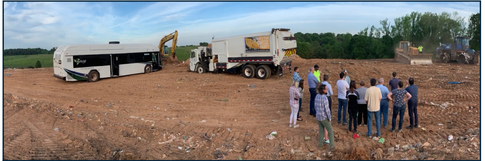
Participants in the 10-week program will visit and tour a variety of facilities and departments.

The refreshed program will offer sessions held at different ACCGov facilities and offices with locations rotating each week. Topics of discussion will include city-county