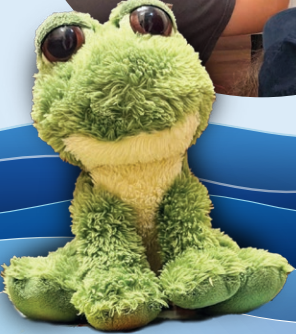
Little Lily hopped to 49 elementary school classrooms.