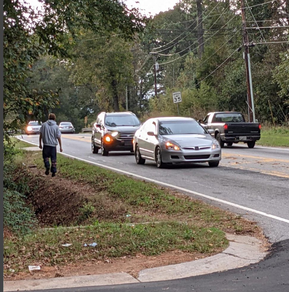
Pedestrian walking along Tallassee Road near Westchester Drive