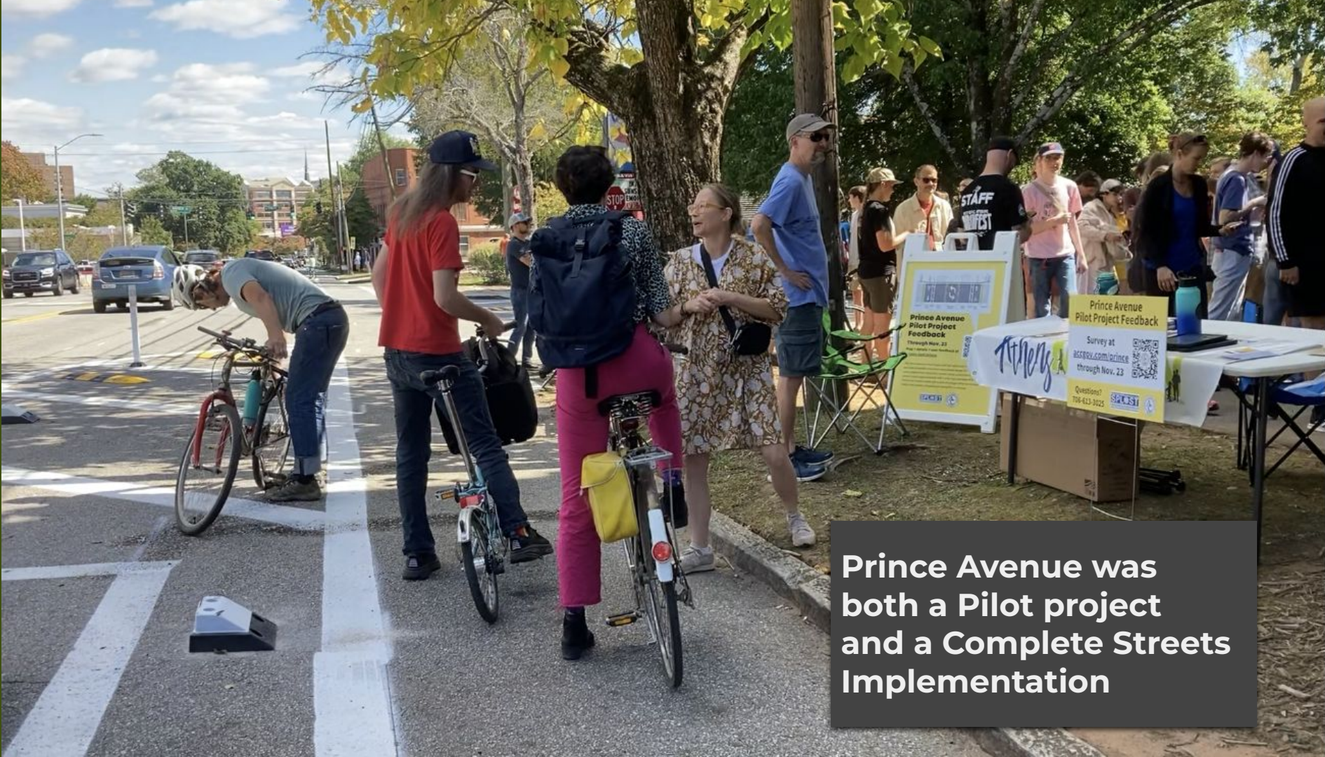
Prince Avenue was both a Pilot project and a Complete Streets Implementation