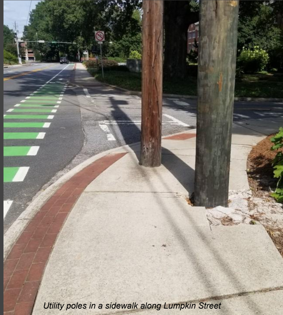
Utility poles in a sidewalk along Lumpkin Street

Identify and fix trip hazards and identify and remove ADA barriers in existing sidewalk network