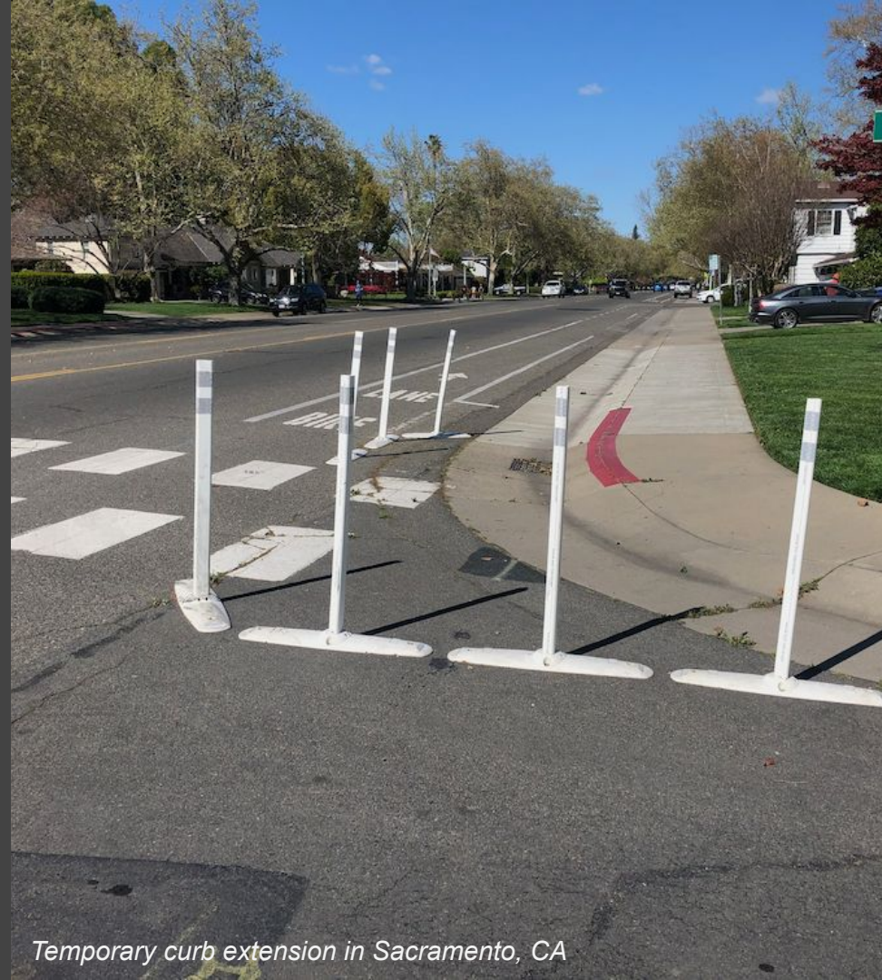
Temporary curb extension in Sacramento, CA