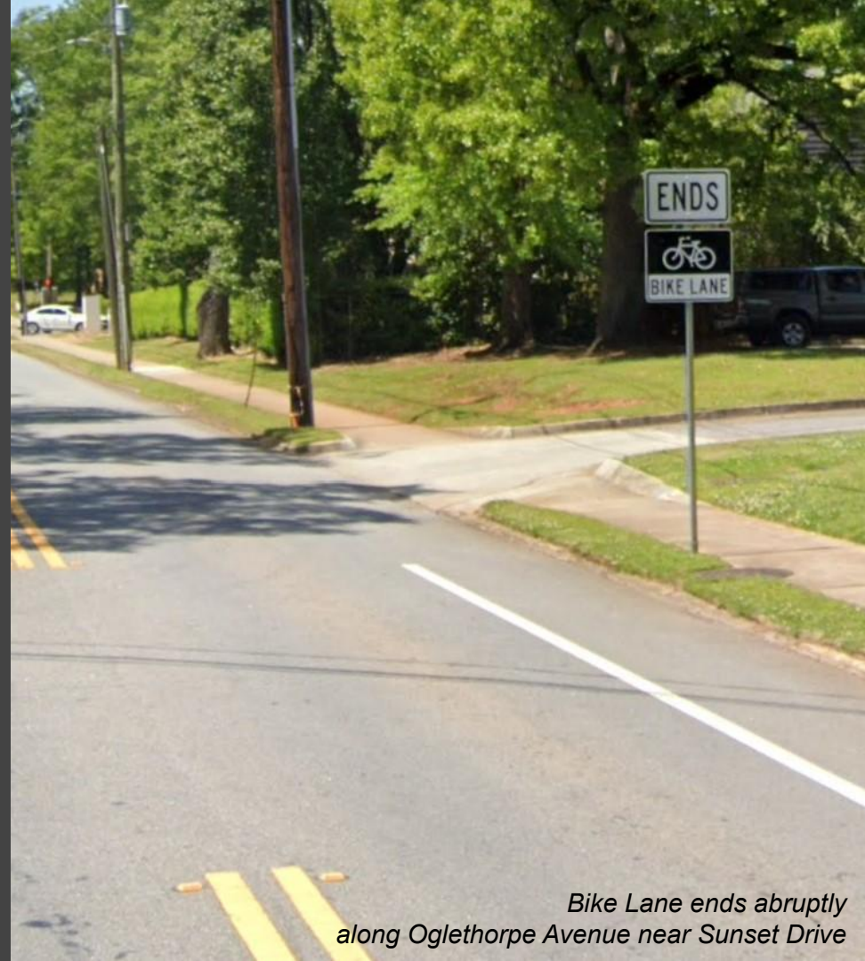
Bike Lane ends abruptly along Oglethorpe Avenue near Sunset Drive