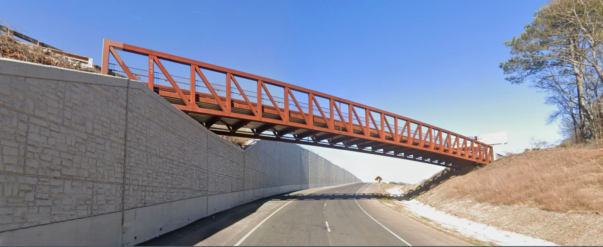
Firefly Trail on-ramp bridge, Athens, GA We built the bridge ahead of GDOT building the on-ramp.