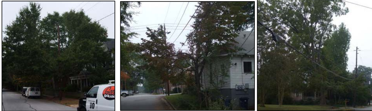
Figure 3. Examples of correctly performed natural target pruning.