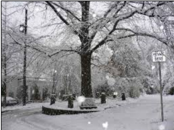
Figure 1: Athens' most famous Landmark, The Tree That Owns Itself