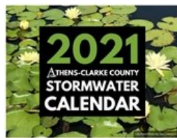
This year's cover photo was taken by Sue Lawrence.