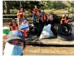
Volunteers from the Walker Park site, posing with their collected trash!