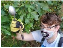
Interesting finds at the Riverbend Parkway site.