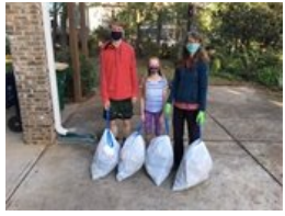
The Bruner Family, after completing their own neighborhood clean-up.