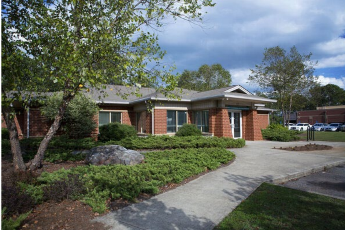
Athens Neighborhood Health Clinic