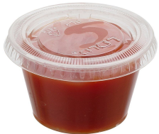
PLASTIC SAUCE CUPS