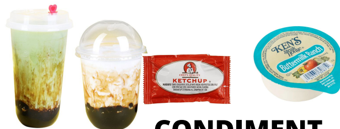
CONDIMENT DIRTY PLASTIC PACKETS CONTAINERS