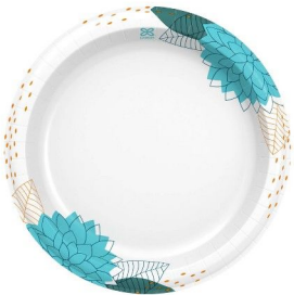
PLASTIC-COATED PAPER PLATES

The items listed below are examples of materials NOT allowed under Policy SW-021. Compostable alternatives MUST be used. Cups used for solid foods and/or more viscous fluids (e.g., frappes, milkshakes, soups, chili) must be compostable.