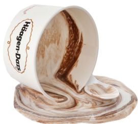
DIRTY PLASTIC-COATED PAPER CONTAINERS