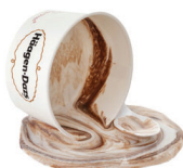
DIRTY PLASTIC- COATED PAPER CONTAINERS