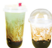
DIRTY PLASTIC CONTAINERS