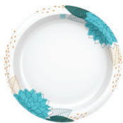
PLASTIC-COATED PAPER PLATES

The items listed below are examples of materials NOT allowed under Policy SW-021. Compostable alternatives MUST be used. Cups used for solid foods and/or more viscous fluids (e.g., frappes, milkshakes, soups, chili) must be compostable.